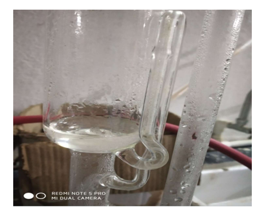
figure 3. Distillate