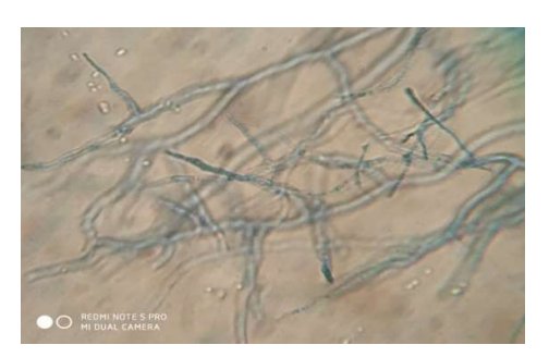
Fig. 1. A, Growth of isolate on Basal media. B. microscopic image of isolate